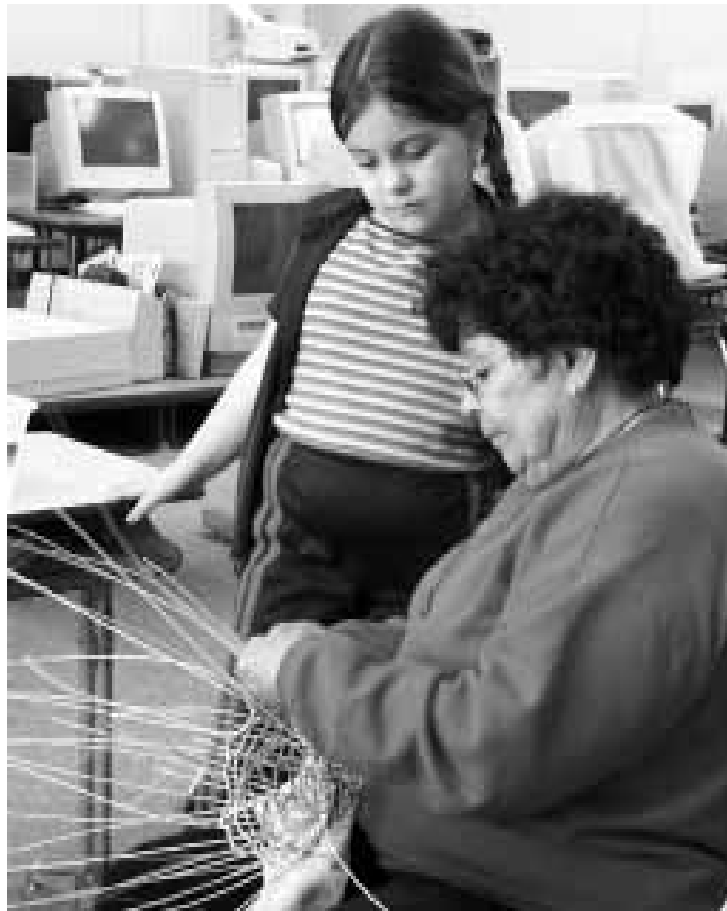
A CIBA elder demonstrates basketweaving to a member of the current generation.